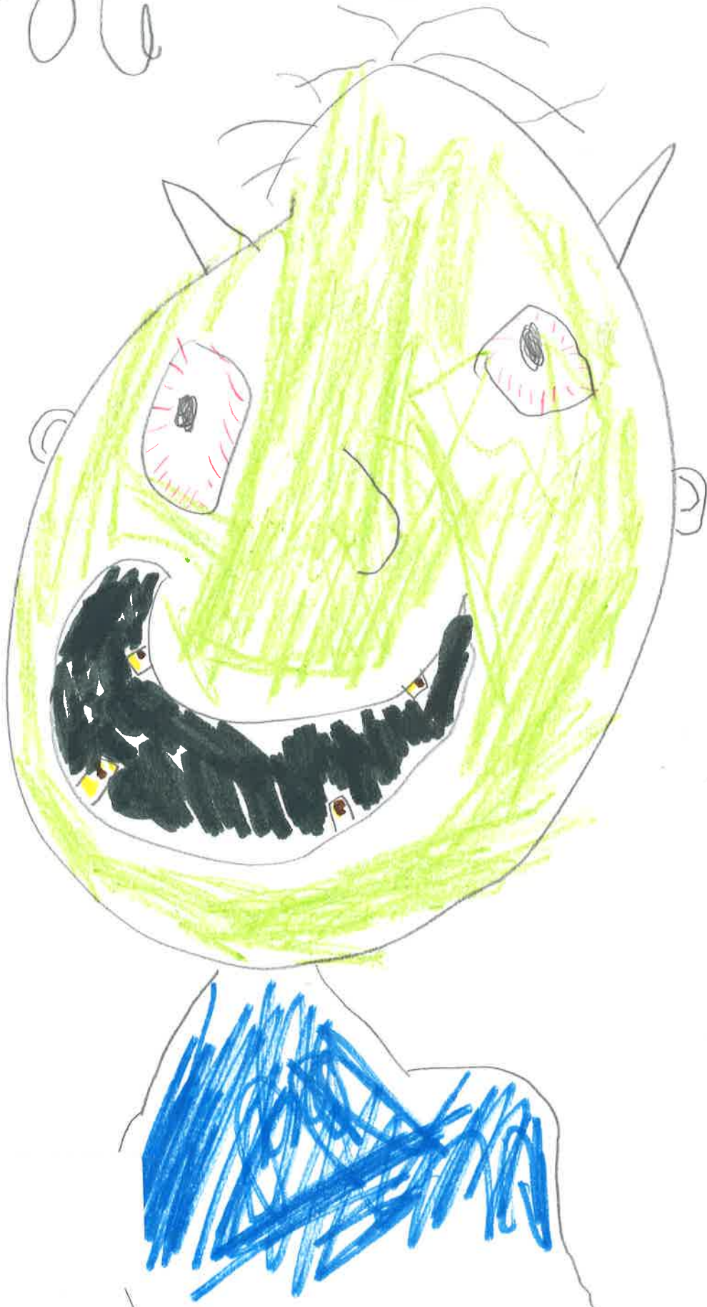
Logan Rice 2nd Place Kindergarten Rose Bud Elementary