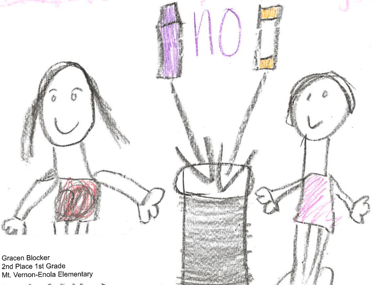
Gracen Blocker 2nd Place 1st Grade Mt. Vernon-Enola Elementary

DO NOT Vape Vape or smoke because it can get to your lungs and hurt your lungs.